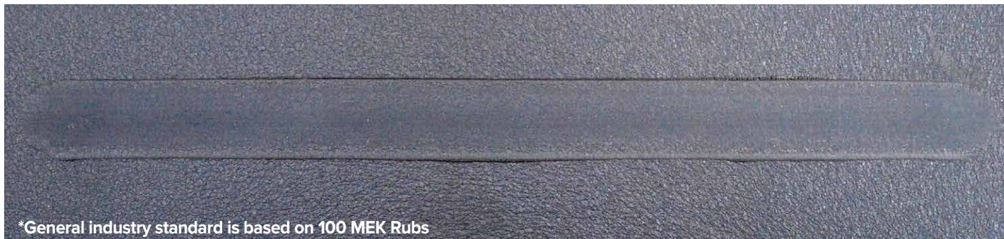
*General industry standard is based on 100 MEK Rubs