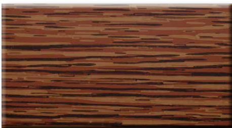
Red Cedar (XWOORC01)