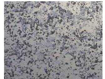
Weathered Zinc SRI 47 • XGRAWZ01

Representation of color may vary due to printing limitations. Actual metal samples are available upon request.