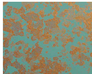
Antique Copper SRI 35 • XGRAAP01

Despite an aged appearance, these finishes employ proven, superior paint technology. This means these colors can be used to reduce building cooling costs and carry up to a 30 year limited finish warranty