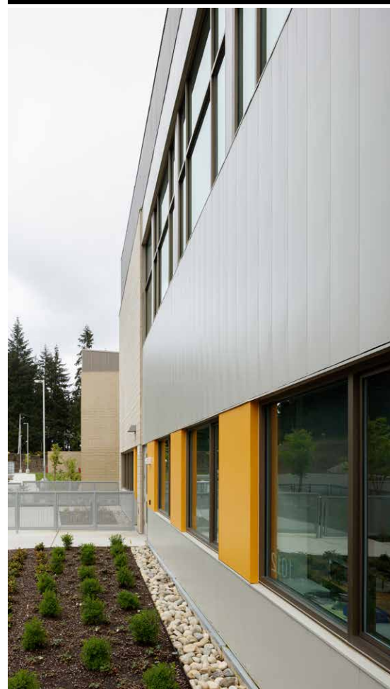
Issaquah Middle School , WA

To order DuraPrep® Prep 400 at a location near you, go to www.ppgpaints.com/products/duraprep-prep400-overspray-remover