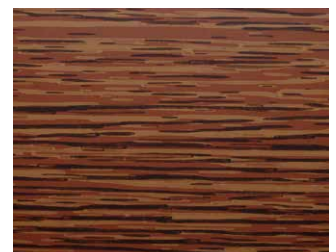
Red Cedar SRI 37 • XWOORC01

Representation of color may vary due to printing limitations. Actual metal samples are available upon request.